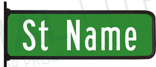
TSB-223-930 (Bolt On Sign Frame - for use with 3" or 4" poles) Holds one 30" W x 9" H Sign. Sign Blade Sold Separately.