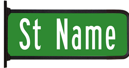
TSB-223-924 (Bolt On Sign Frame - for use with 3" or 4" poles) Holds one 24" W x 9" H Sign. Sign Blade Sold Separately.