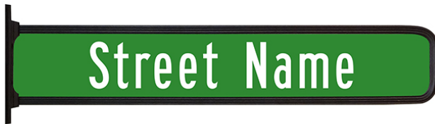
TSB-223-636 (Bolt On Sign Frame - for use with 3" or 4" poles) Holds one 36" W x 6" H Sign. Sign Blade Sold Separately.