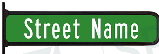
TSB-223-630 (Bolt On Sign Frame - for use with 3" or 4" poles) Holds one 30" W x 6" H Sign. Sign Blade Sold Separately.