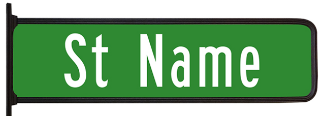
TSB-223-936 (Bolt On Sign Frame - for use with 3" or 4" poles) Holds one 36" W x 9" H Sign. Sign Blade Sold Separately.