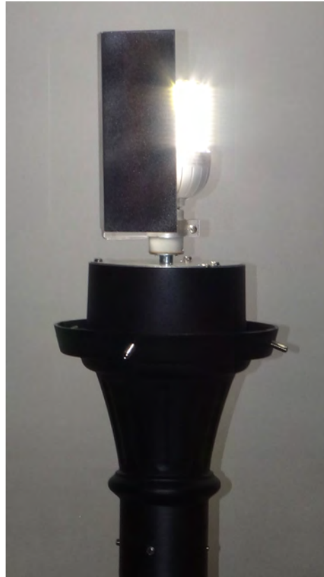
HSS-90 Side View