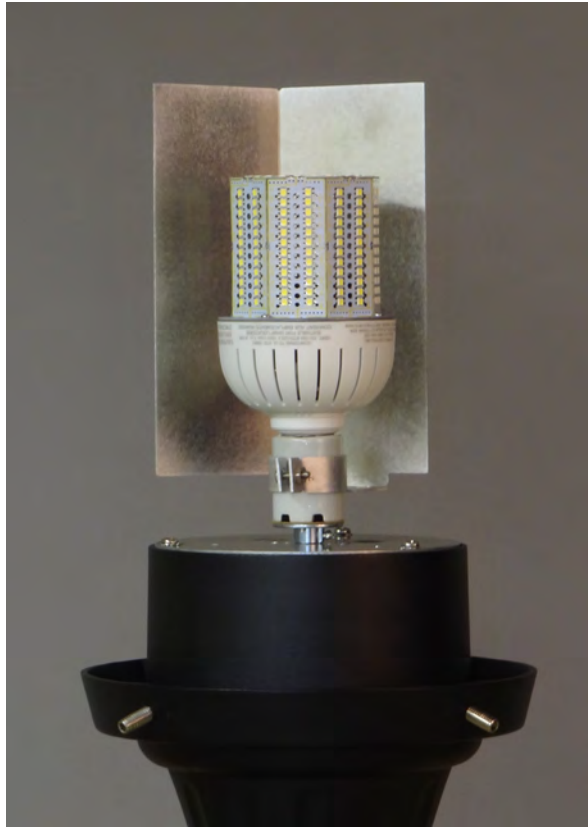
HSS-90 Front View